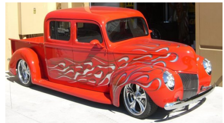
"BEST OF SHOW", 2008

Please print clearly, complete each item, read the liability statement, and sign below. Visitors subject to County Parking Fee.